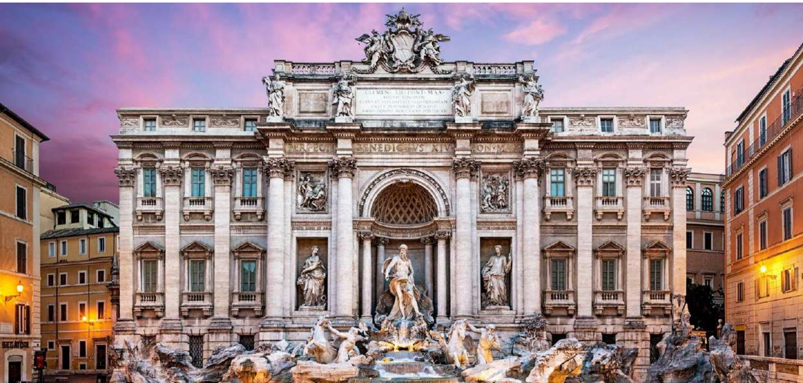
* Fontana di Trevi